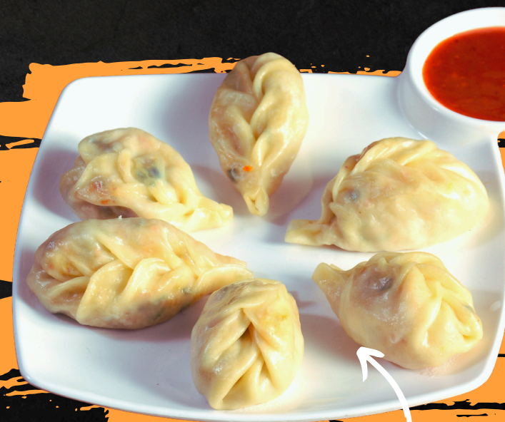
香料雞肉蒸餃 CHICKEN MOMO (6pc)

炸豆球，洋蔥，大蒜，青椒，番茄醬 Falafel, onion, garlic, capsicum, ketchup