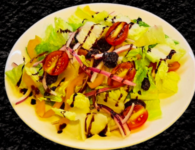
田園沙拉 GARDEN SALAD