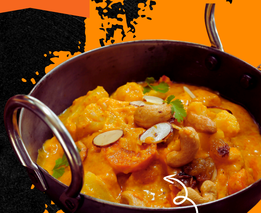
綜合時蔬 MIX SABZI