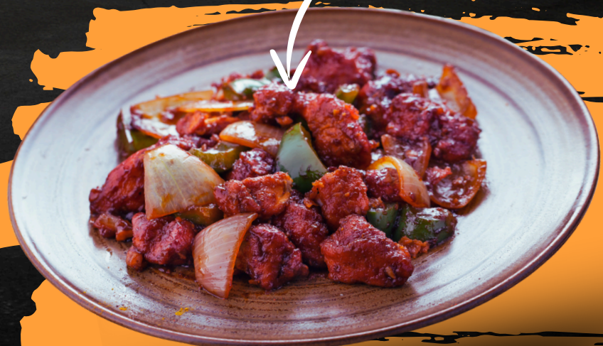
辣炒雞肉 CHILI CHICKEN

Please inform in advance if you have any food allergies or restrictions. Photos are for reference only. There will be an additional 10% service & cleaning charge added to your final bill 如有任何食物過敏或忌口；請在菜單忌口選項點選告知。菜單上圖片僅供參考，以實際餐點為主。本店內用需酌收10%清潔/服務費