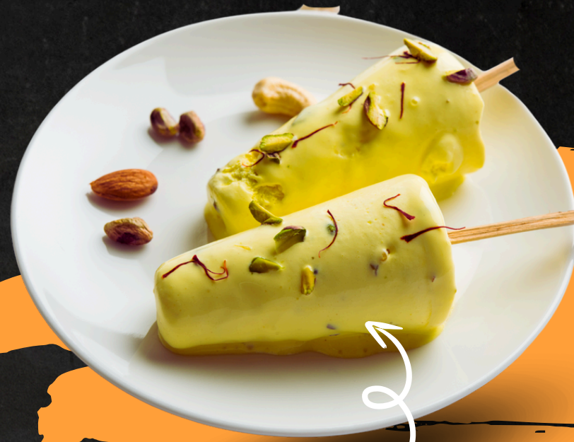
印度冰淇淋 INDIAN KULFI