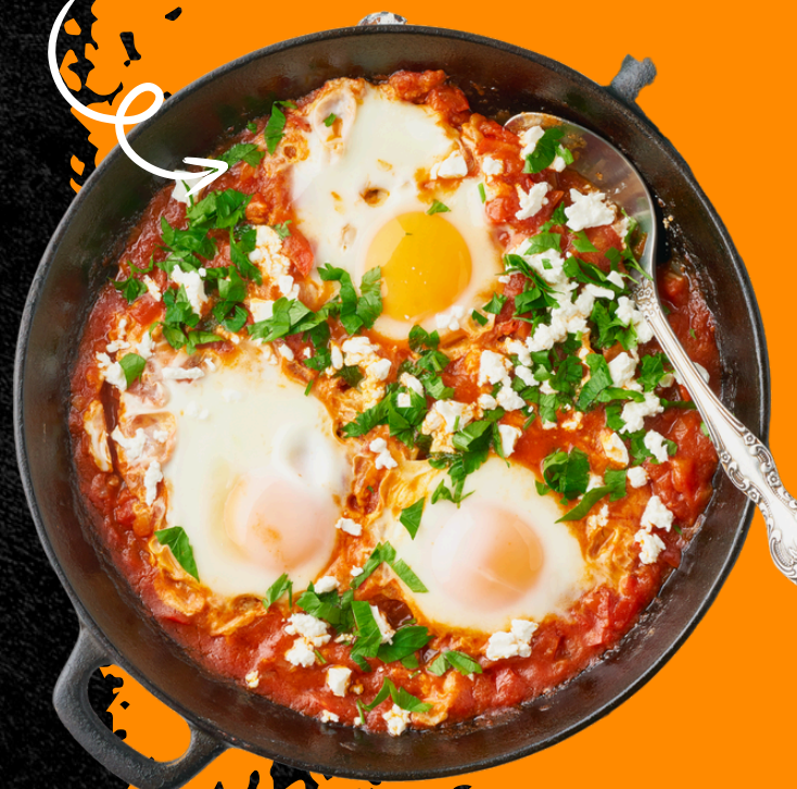
中東沙卡蔬卡雞蛋 ANDA SHAKSHUKA