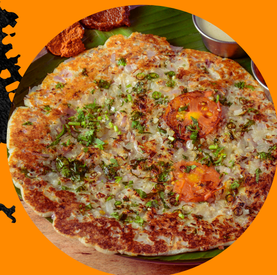
蔬菜厚煎米餅 VEG UTTAPAM