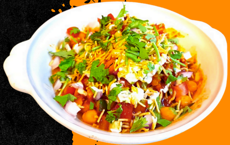
優格脆餅 PAPDI CHAAT