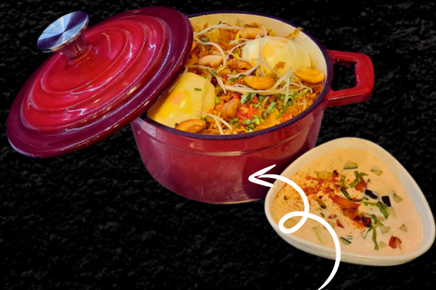
加爾各答香料飯 (正常) KOLKATA BIRYANI (N)