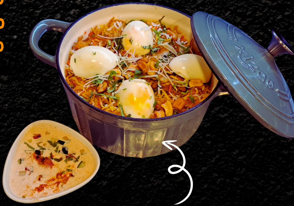
加爾各答香料飯 (大份) KOLKATA BIRYANI (L)

Please inform in advance if you have any food allergies or restrictions. Photos are for reference only. There will be an additional 10% service & cleaning charge added to your final bill 如有任何食物過敏或忌口；請在菜單忌口選項點選告知。菜單上圖片僅供參考，以實際餐點為主。本店內用需酌收10%清潔/服務費