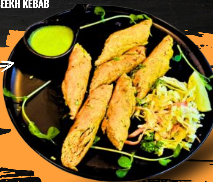
烤香料碎雞肉串 CHICKEN SEEKH KEBAB

Please inform in advance if you have any food allergies or restrictions. Photos are for reference only. There will be an additional 10% service & cleaning charge added to your final bill 如有任何食物過敏或忌口；請在菜單忌口選項點選告知。菜單上圖片僅供參考，以實際餐點為主。本店內用需酌收10%清潔/服務費