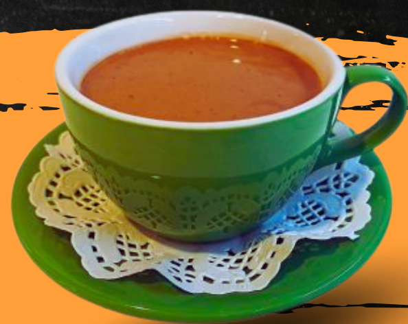
香料奶茶 MASALA TEA