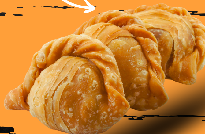
酥皮香料雞肉餃 FLAKY CHICKEN PUFF (3pc)

Please inform in advance if you have any food allergies or restrictions. Photos are for reference only. There will be an additional 10% service & cleaning charge added to your final bill 如有任何食物過敏或忌口；請在菜單忌口選項點選告知。菜單上圖片僅供參考，以實際餐點為主。本店內用需酌收10%清潔/服務費