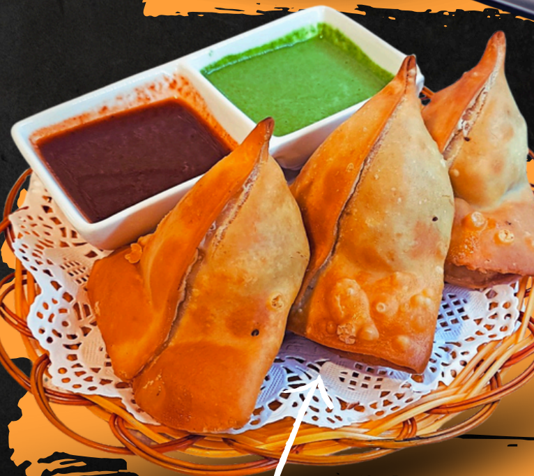
三角蔬菜咖哩餃 VEG SAMOSA (3pc)