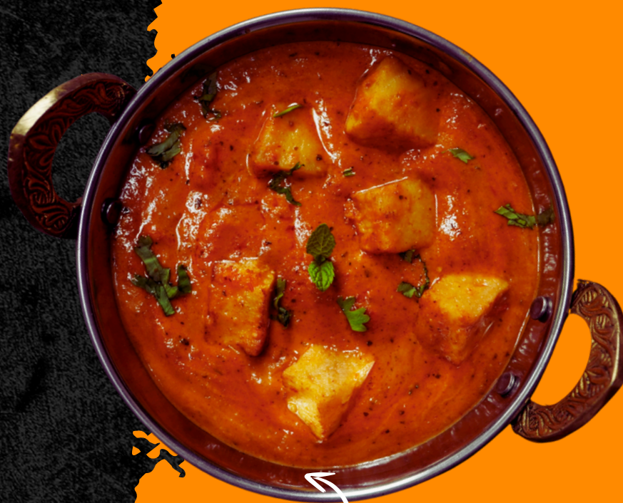
奶油乳酪 PANEER MAKHANI