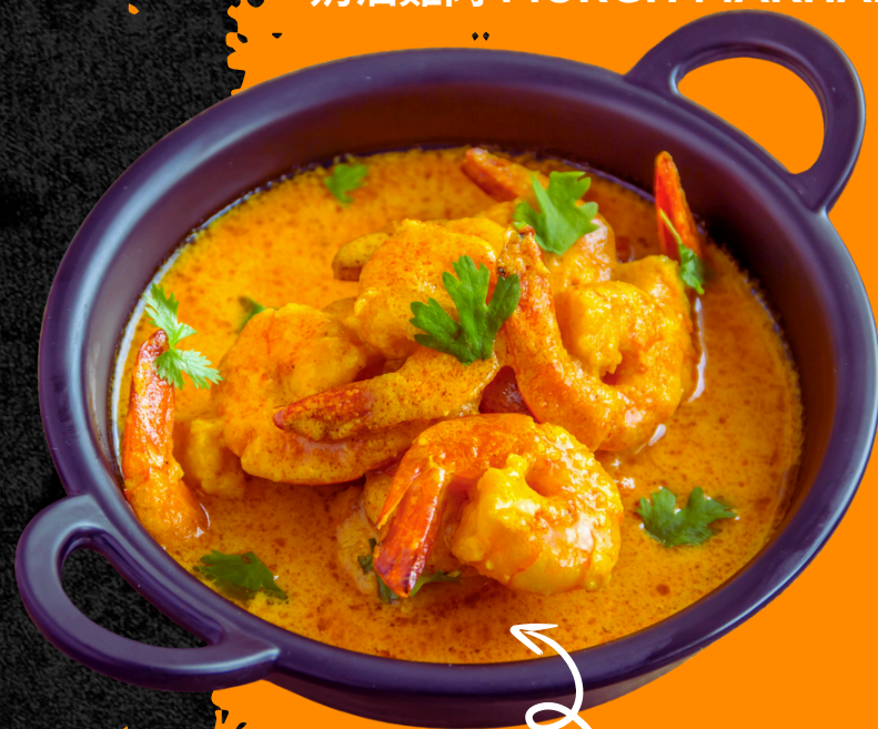
孟加拉鮮蝦椰子 BENGAL CHINGRI