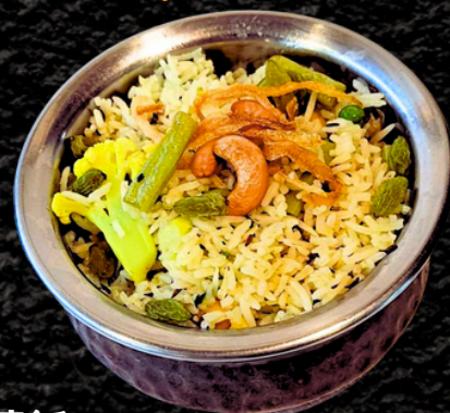
香米蔬菜飯 BASMATI VEG PULAO