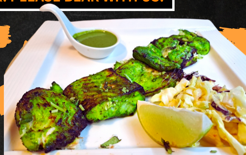
烤薄荷鱸魚肉塊 SEABASS HARIYALI