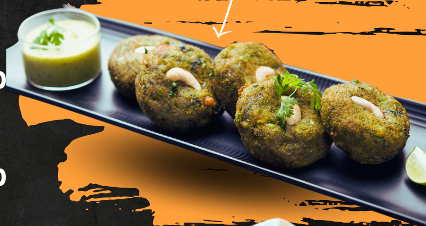
菠菜堅果餅 HARA BHARA KEBAB (5pc)