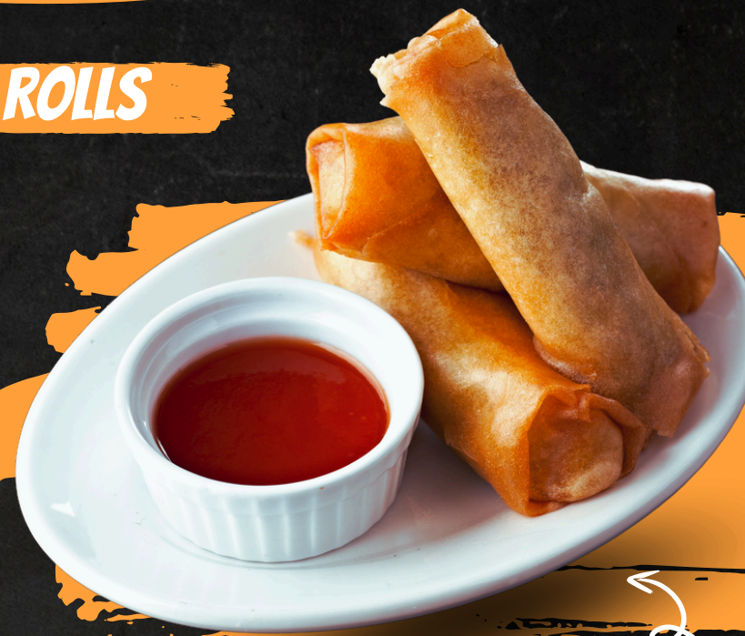
香料雞肉春捲 CHICKEN SPRING ROLL (3pc)

高麗菜，紅蘿蔔，蘑菇，香料 Cabbage, carrots, mushroom, spices