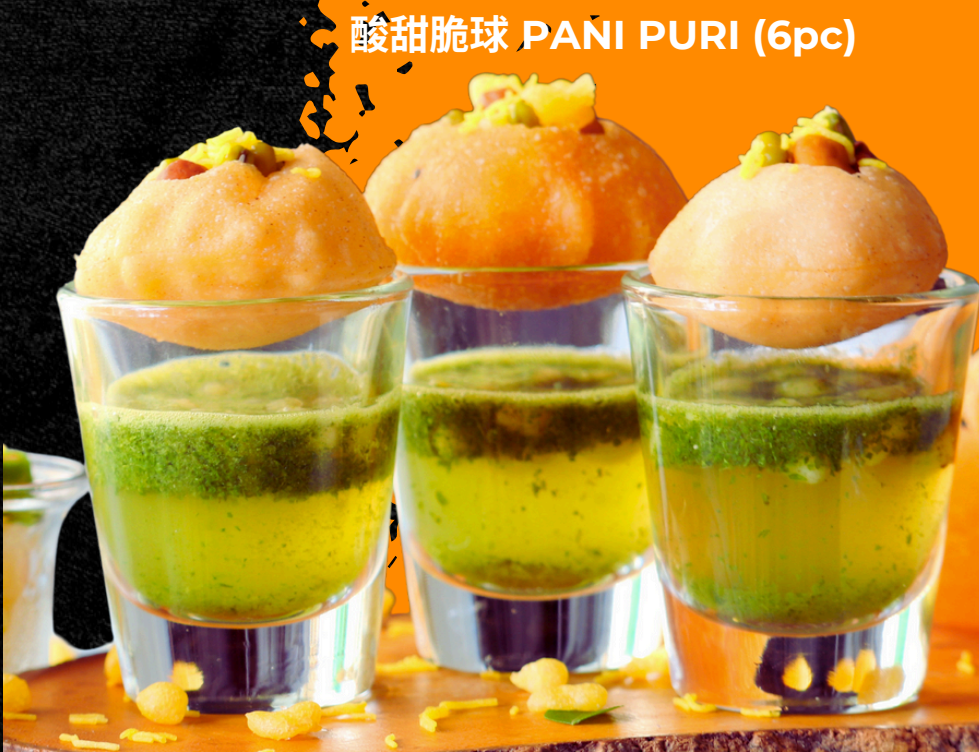
酸甜脆球 PANI PURI (6pc)