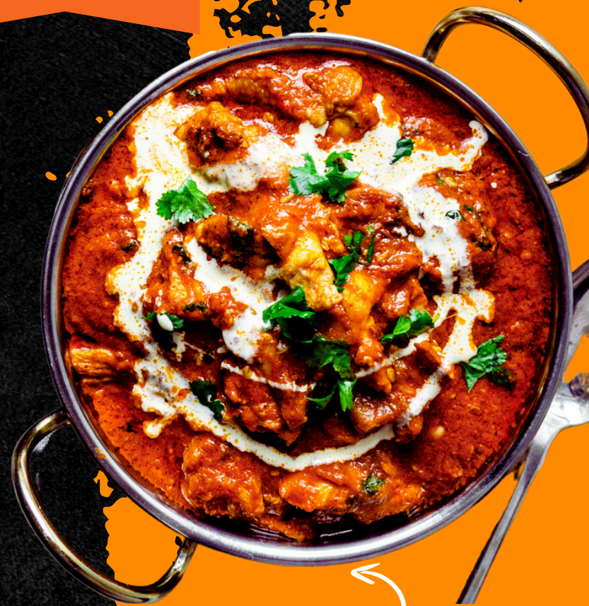
奶油雞肉 MURGH MAKHANI