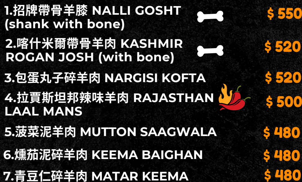
喀什米爾帶骨羊肉 KASHMIR ROGAN JOSH