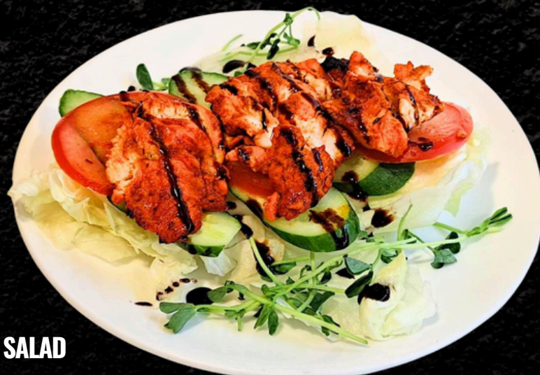
烤雞塊沙拉 CHICKEN TIKKA SALAD

Please inform in advance if you have any food allergies or restrictions. Photos are for reference only. There will be an additional 10% service & cleaning charge added to your final bill 如有任何食物過敏或忌口；請在菜單忌口選項點選告知。菜單上圖片僅供參考，以實際餐點為主。本店內用需酌收10%清潔/服務費