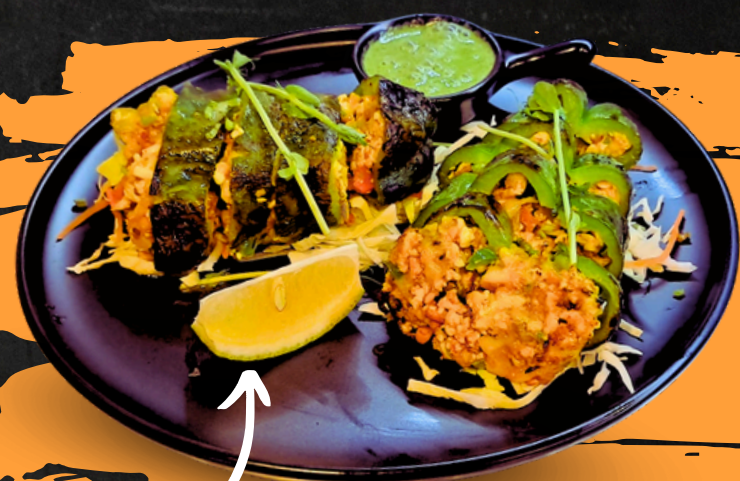
烤內餡香料青椒 STUFFED CAPSICUM