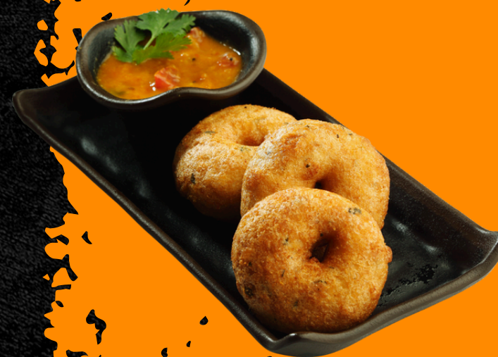
炸豆圈 MEDU VADA (3pc)

Please inform in advance if you have any food allergies or restrictions. Photos are for reference only. There will be an additional 10% service & cleaning charge added to your final bill 如有任何食物過敏或忌口；請在菜單忌口選項點選告知。菜單上圖片僅供參考，以實際餐點為主。本店內用需酌收10%清潔/服務費