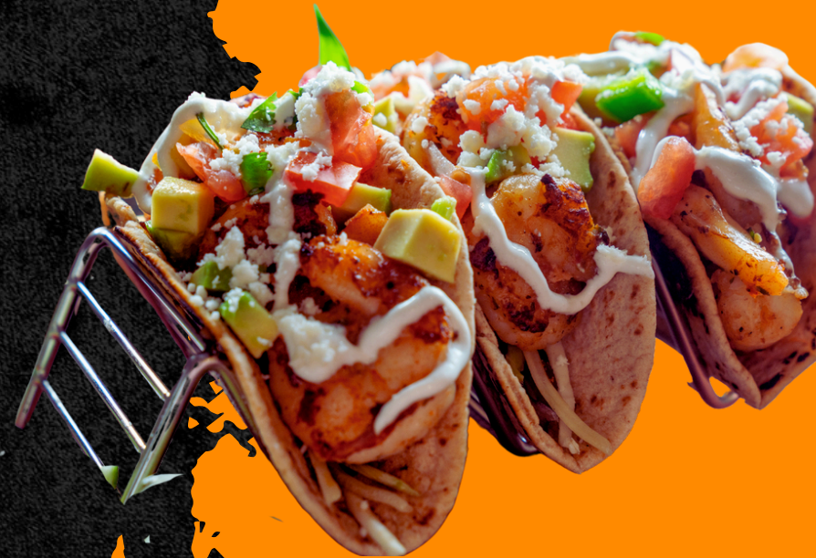
烤雞肉塔可 CHICKEN TACOS (3pc)