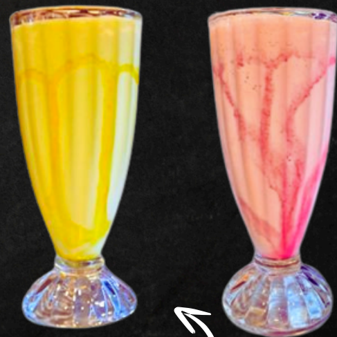
印度優酪乳 INDIAN LASSI