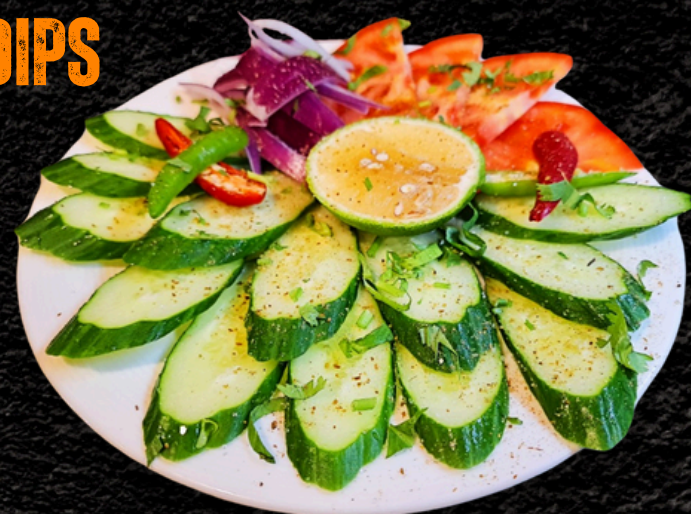
印度黃瓜沙拉 KACHUMBER SALAD

鷹嘴豆，番茄，洋蔥，香料 Chickpea, tomato, onion, spices