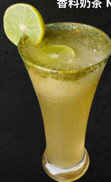
香料檸檬蘇打 MASALA LEMON SODA