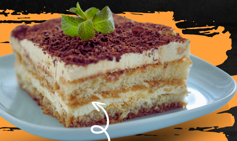
手工提拉米蘇 HANDMADE TIRAMISU

Please inform in advance if you have any food allergies or restrictions. Photos are for reference only. There will be an additional 10% service & cleaning charge added to your final bill 如有任何食物過敏或忌口；請在菜單忌口選項點選告知。菜單上圖片僅供參考，以實際餐點為主。本店內用需酌收10%清潔/服務費