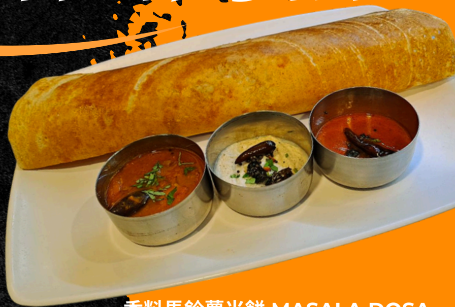
香料馬鈴薯米餅 MASALA DOSA

{ 炸豆圈附上佐料: 椰子醬 Served with : Coconut chutney }